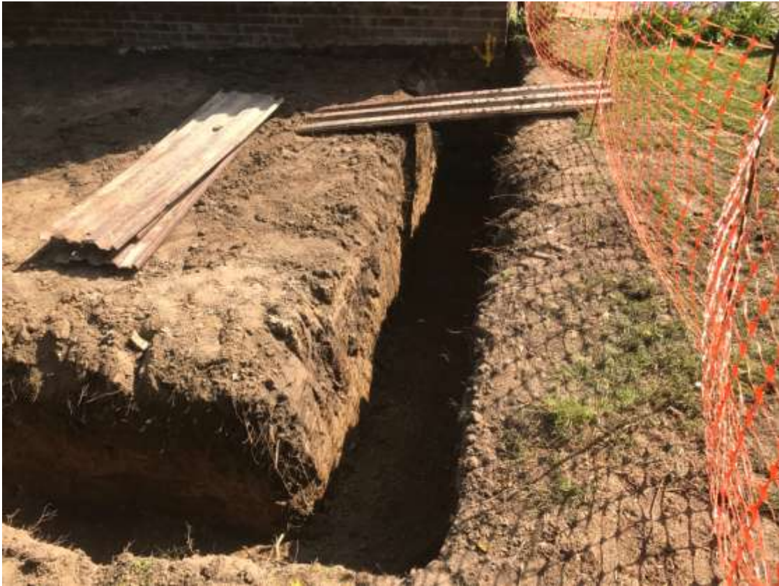
Plate 4. View of foundation trenching (looking W)