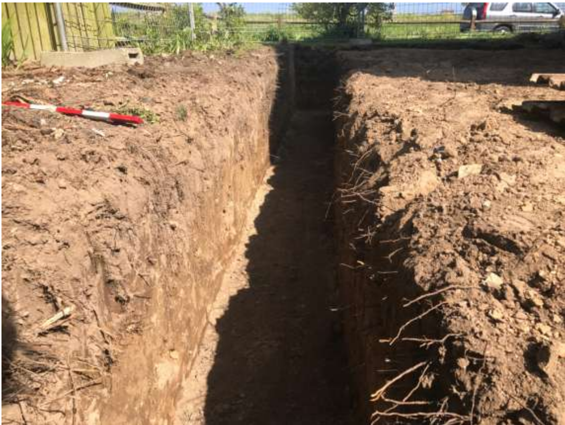
Plate 3. View of foundation trenching (looking E)