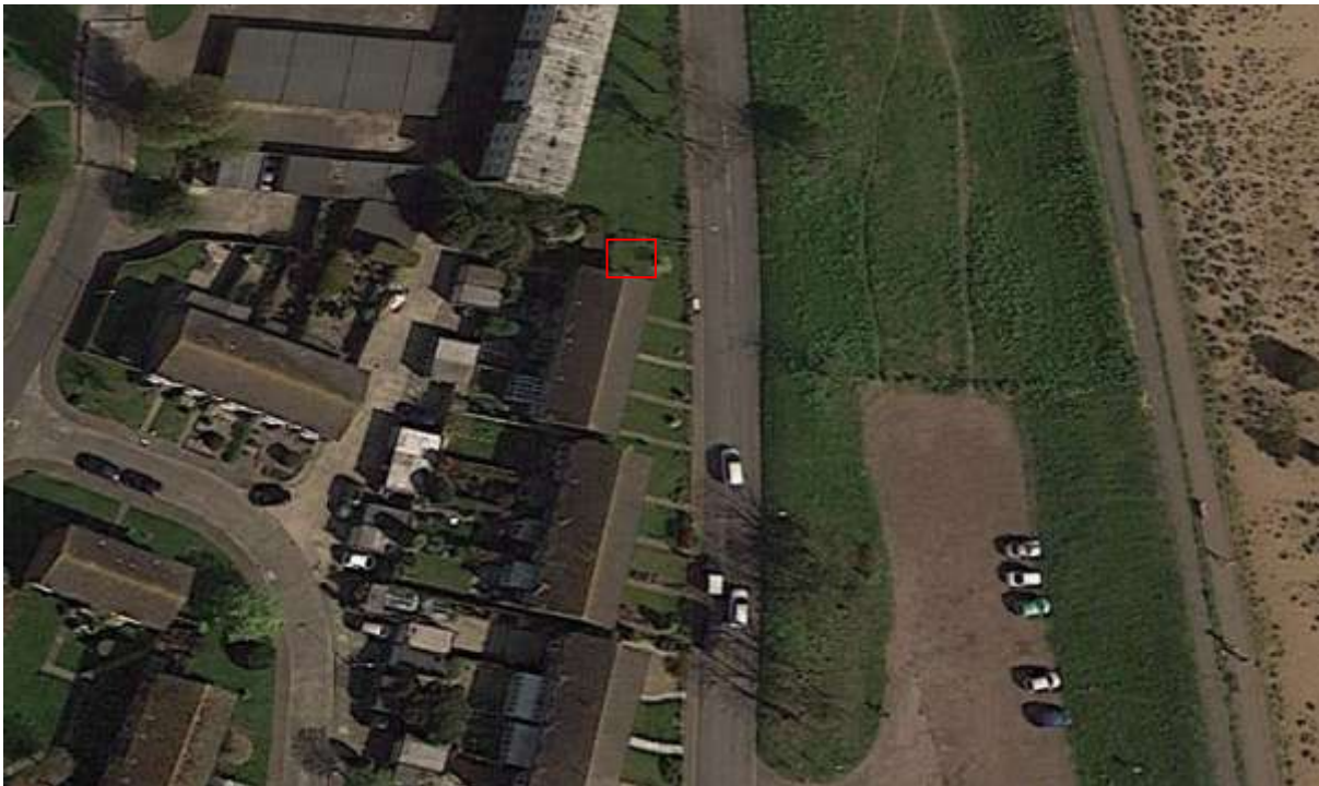
Plate 1. Aerial view of site (red target) showing the site prior to development.

(Google Earth 20/4/2017: Eye altitude 217m).