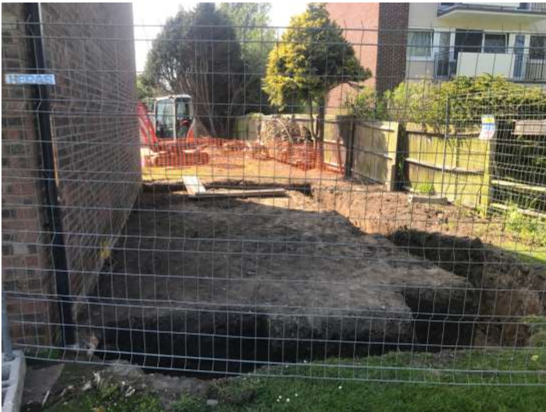
Plate 7. Completed foundation trench (looking W)