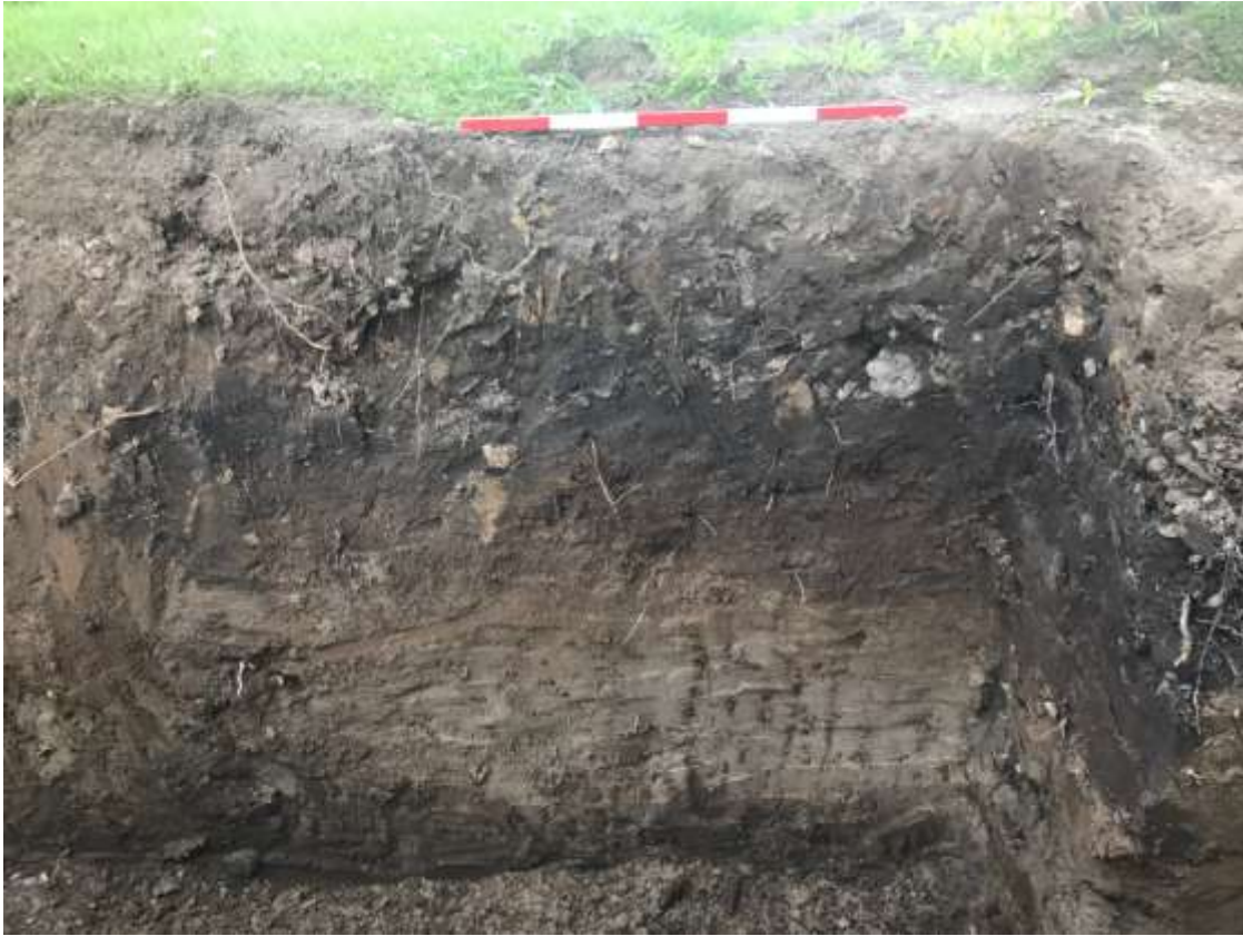
Plate 5. View of trench section (looking E)