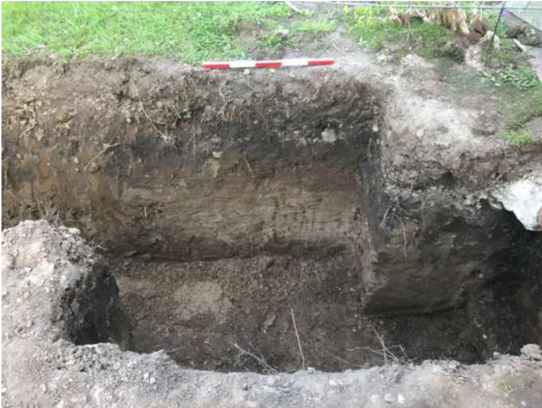
Plate 6. View of trench section (looking E)