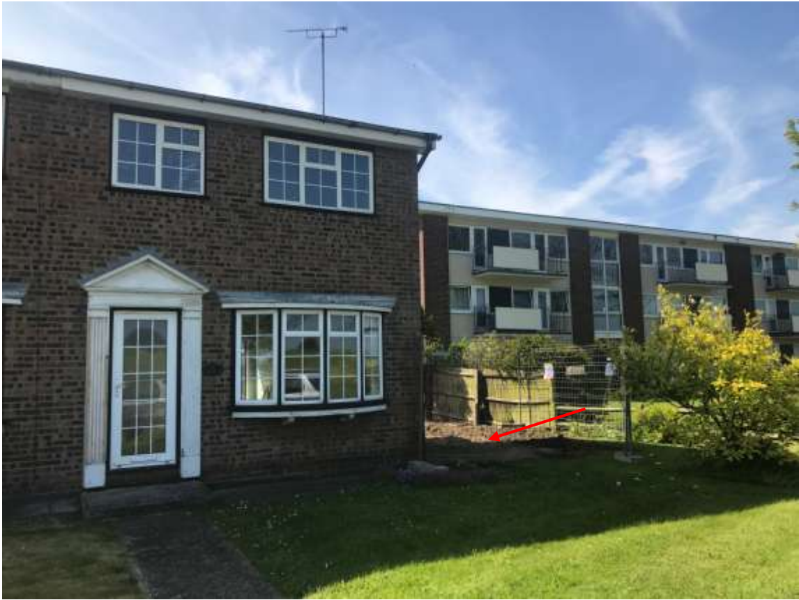
Plate 2. General view of site (looking WNW)